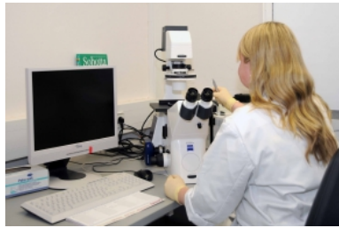
Flow cytometry / Real-Time PCR room